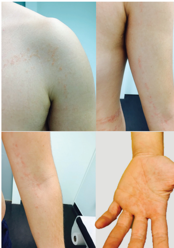
Figure 2. Clinical aspect of the lesions: erythematous papules and vesicles distributed on the upper left limb, forming a linear configuration.

configuration, respectively. A punch biopsy revealed hyperkeratosis, acanthosis, spongiosis, and lichenoid infiltrates in the dermis ( Figure 3 ). The patient was treated with betamethasone cream with complete resolution of the cutaneous lesions in 3 weeks.