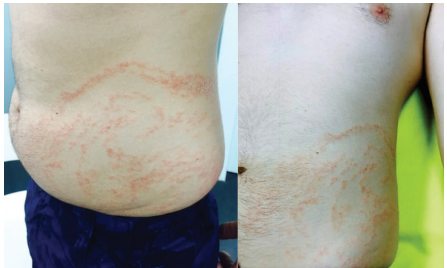
Figure 1. Clinical aspect of the lesions - erythematous papules and vesicles distributed on the left side of the abdomen grouped in a whorl configuration.

A 21-year-old man presented with unilateral pruritic cutaneous lesions that had appeared 1 week before. There was no history of chronic disease or medication. Dermatologic examination ( Figure 1, 2 ) revealed erythematous papules and vesicles distributed on the left side of the abdomen and upper left limb, grouped along these locations in a whorl and streak