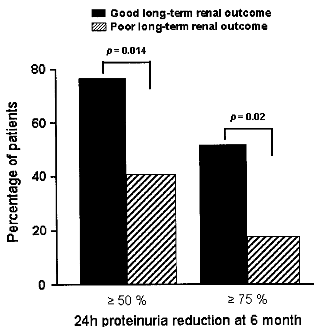
Figure 2. Percentage of patients in the good long-term renal outcome group and the poor long-term renal outcome group who had at least a 50% reduction or at least a 75% reduction in 24-hour urinary protein levels at 6 months. P values were calculated by Fisher's exact test.

long-term renal outcome group (Figure 2). The positive predictive value of a 75% decrease in proteinuria at 6 months for good long-term renal outcome was 90%. Similar results were obtained when absolute levels of improvement were analyzed: the positive predictive value of a 24-hour urinary protein level <1 gm at 6 months for good long-term renal outcome was 87%.